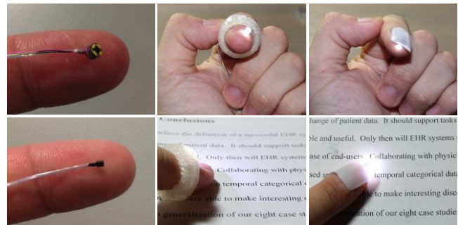
(a) NanEye2C with and without 4 LEDs.

http://dx.doi.org/10.1145/2700648.2811381